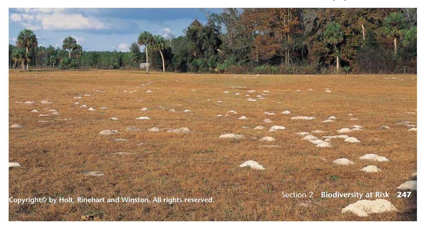
Figure 8 ➤ Mounds made by imported fire ants cover many fields in the southeastern United States. As with many invasive exotic species, these ants had no natural predators and little competition from native species when they were first brought into the country by accident.

In recent decades, scientists have observed a worldwide decline in amphibian species. Unlike most cases of habitat loss or overhunting, there are no clear causes for these extinctions. But there is growing evidence to indicate two probable causes: the pollution of water sources with hormone-like chemicals and increased UV radiation exposure due to the thinning of the Earth's ozone layer.