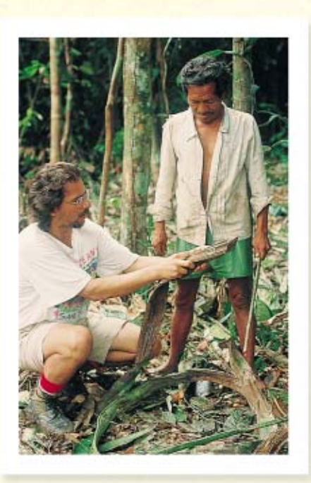
► This botanist is researching the uses of rain-forest plants and other species with the help of local people.

Other researchers are more interested in another special feature of the Amazon—native peoples. Some Amazonian natives, such as the Yanomamö, are still living a lifestyle of intimate connection to their forest