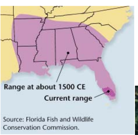
Figure 7 ▶ Fewer than 80 Florida panthers (right) remain in the wild. Almost all of the habitat (below) of this cougar subspecies has been destroyed or fragmented by commercial and housing development.